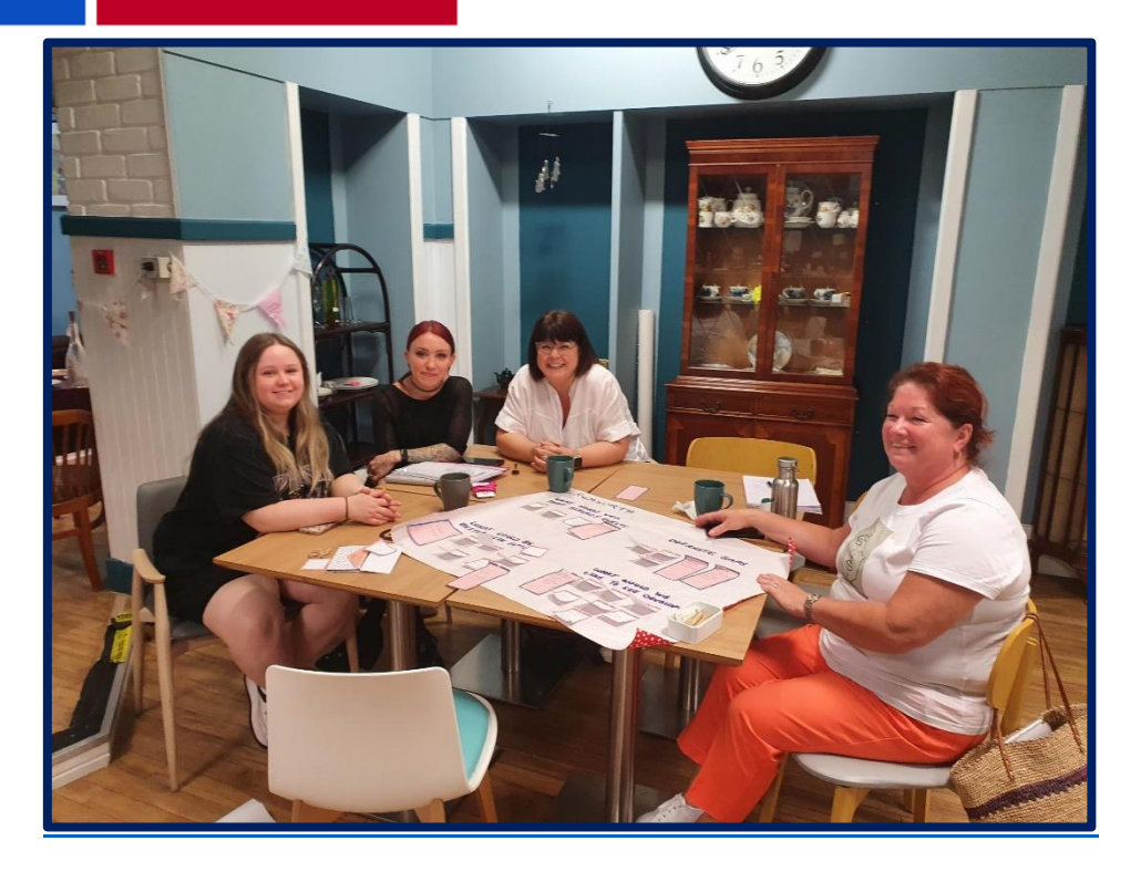
Figure 2 Some of the Representatives on the Rumworth Task Group