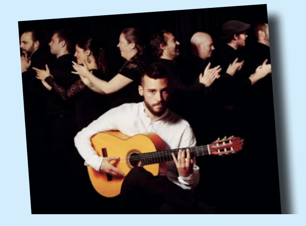
The Art of Believing - Flamenco 12th October