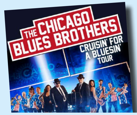
The Chicago Blues Brothers 14th October