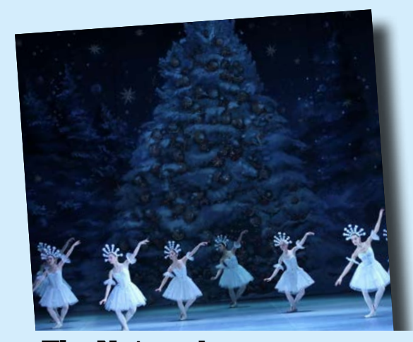
The Nutcracker 26th October