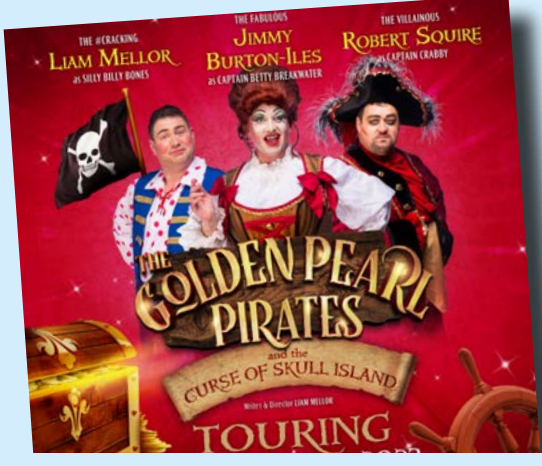
The Golden Pearl Pirates 31st October