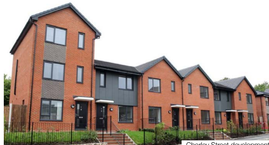
Chorley Street development