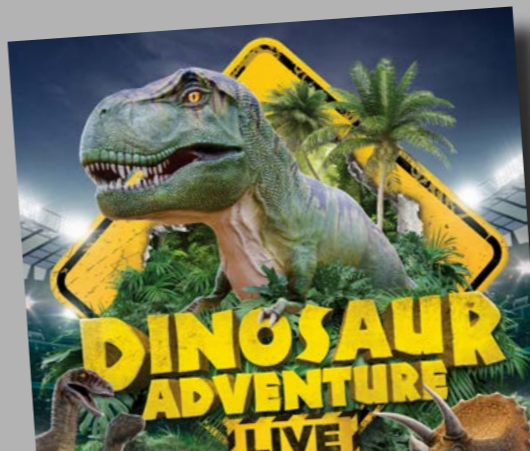
Dinosaur Adventure Live 7th August 2022