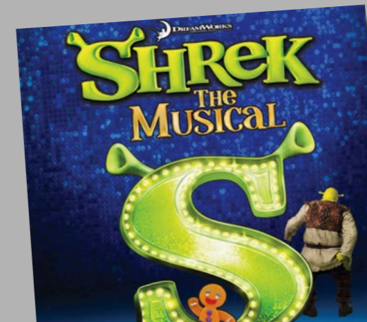
Shrek the Musical 20th - 24th September 2022