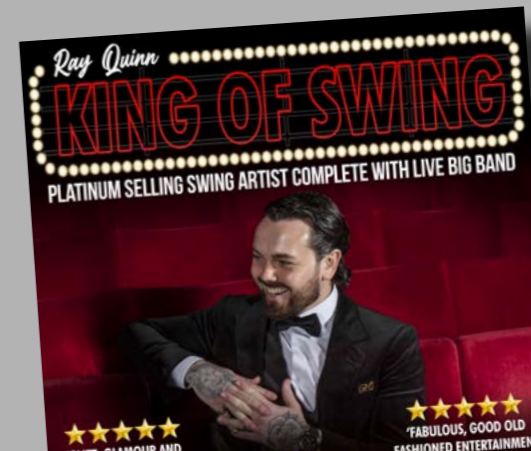
Ray Quinn King of Swing 9th September 2022