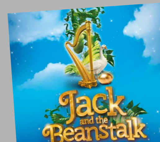
Jack and the Beanstalk 2nd Dec 2022- 1st Jan 2023