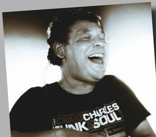
Craig Charles Funk & Soul Club 16th September 2022