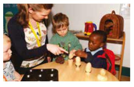
For example, your child points to a car, you say "car". Your child says "car", you say "red car". They say "red car", you say "yes, big red car".

Whatever stage a child is at, repeat what they do or say and add one word.