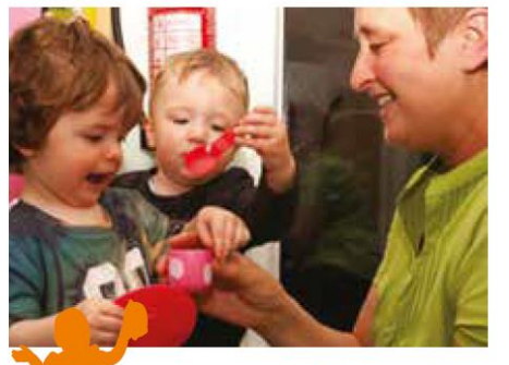
For example, "Do you want apple or banana?"

Offer choices as often as possible throughout the day. Show and name the alternatives.