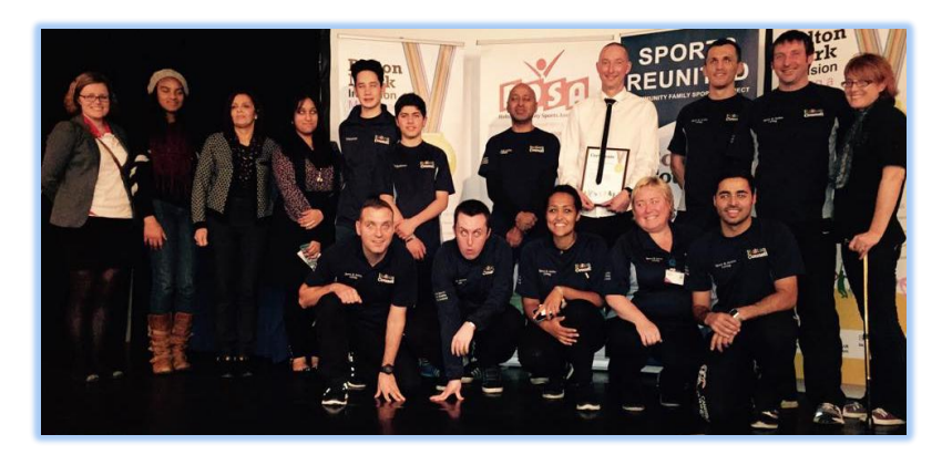
Inclusion Bolton Mark Presentation 1