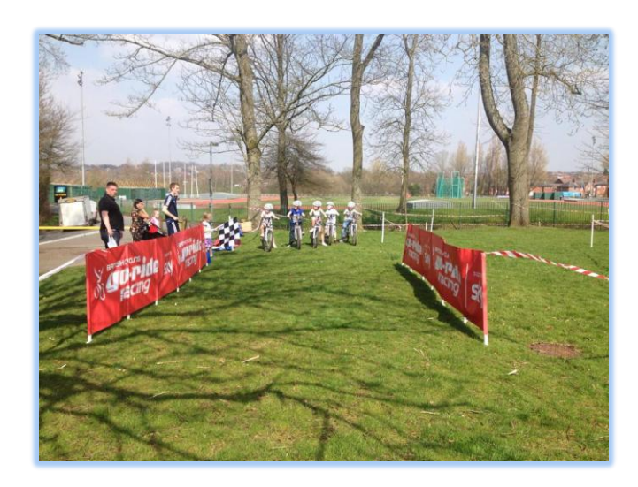
British Cycling at Leverhulme Park 1

Sports Reunited at present is working with the following N.G.B's: British Orienteering, British Cycling, L.T.A & British Wrestling