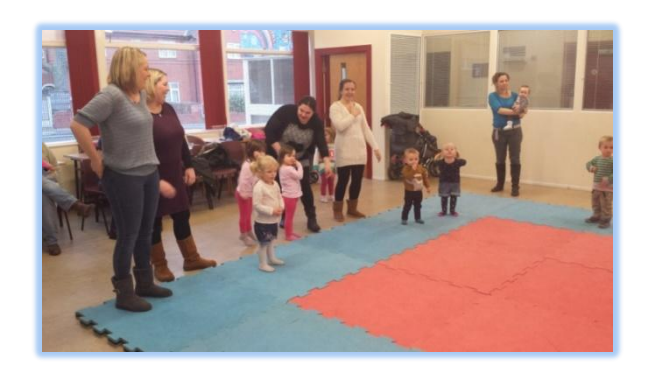
Wrestling @ Washacre 1

Bolton Council's Sport and Active Living Service has a whole team dedicated to the development of priority sports in Bolton. Sports Reunited is working with a number of these priority sports and in close partnership with the relevant local leads and the corresponding National Governing Body to establish relevant talent pathways and appropriate introductory grass route provision. This can be in the form of tag wrestling, mini tennis, Xplorer orienteering. By working with the N.G.B's we can access the most up to date coaching and delivery methods that are available.