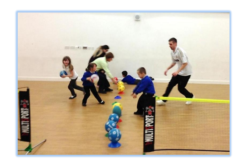
St. Catharine's Core Session 1

We have changed venues on a number of occasions to cope with demand and suitability of activity. We have great relations with all the venues we have delivered in and now we have a selection of venue options that we can use for our core sessions depending on what particular activities we are delivering.